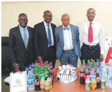
Asst. Registrar, Registrar, VC and Director, TU Consult.