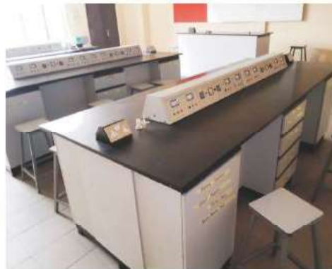
Physics with Electronics Laboratory

Trinity University, on Thursday 28th November, 2019 played host to the N.U.C Resource Verification Panel that visited the Institution to ascertain her level of preparedness to commence four (4) new programmes namely: Nursing Science Laboratory Technology, International Relations and Physics with Electronics. The overall panel comprised of four N.U.C. officials and eight professionals.