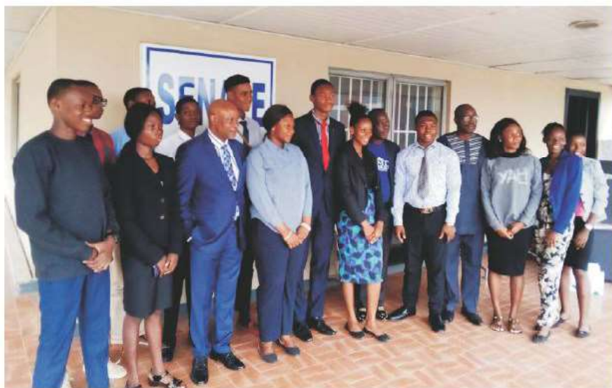
Trinity University Pioneer Students with the VC and Registrar