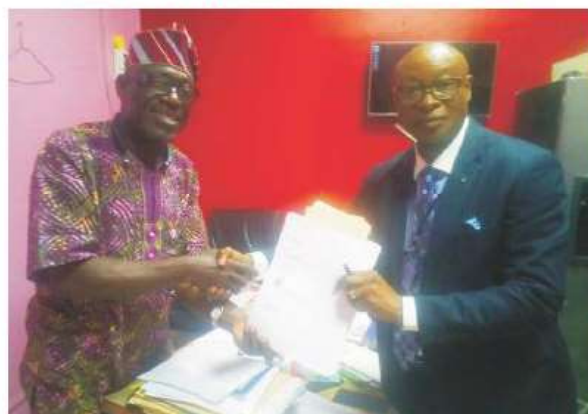
Trinity University Signs MOU with LASUTH.