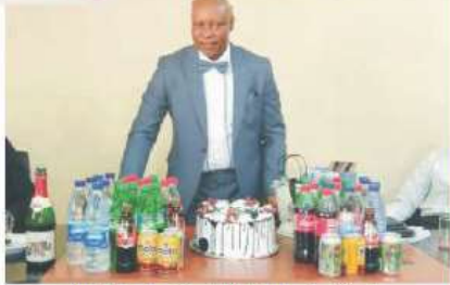
VC Marks 61st Birthday in Style