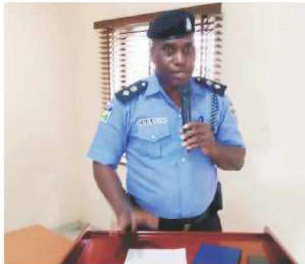
DPO, Yaba Police Station