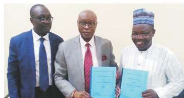
Trinity University Signs MOU with Commit Technology and Consult