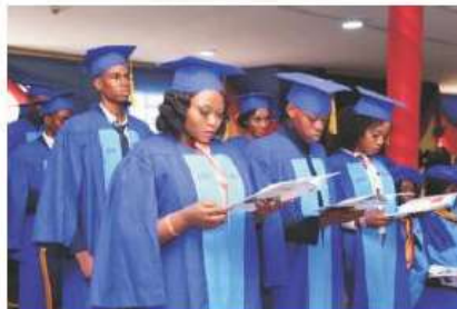
Students taking oath during the ceremony.