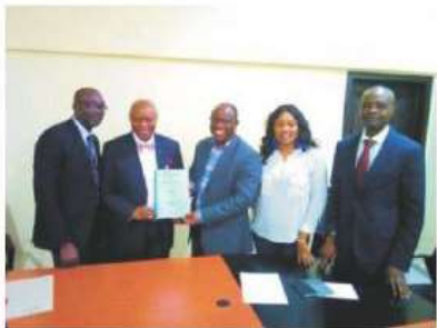
At the signing of an MOU with LBH