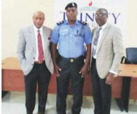
DPO, Yaba Police Station's visit to Trinity University