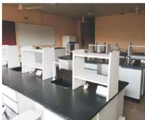
Medical & Science Laboratory