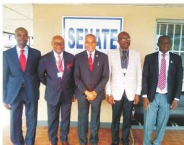
Executive Chairman of the CLMI, Lagos, (middle)