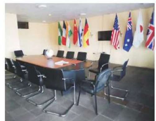
International Relations Studio